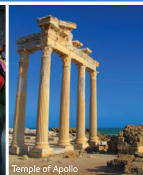
Temple of Apollo