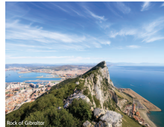
Rock of Gibraltar

"Short flight, choice of 5 or 7 days, with excursions included and a 4-star hotel. Perfect break for some winter sun." Mel, Friendship Travel