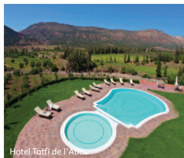
Hotel Tatfi de l'Atlas